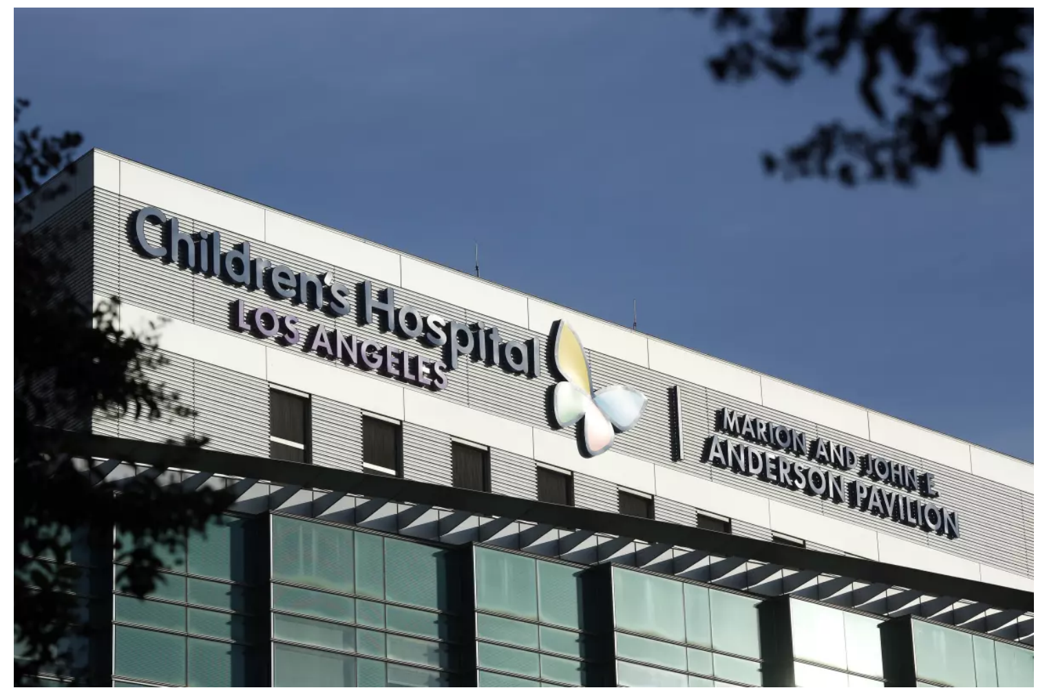
Children's Hospital Los Angeles in 2020.