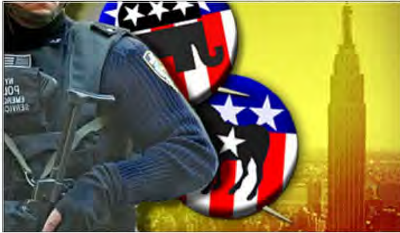
security election democrat republican terror antiterrorism homeland security GOP Democrat / AP / CBS

Comment / Shares / Tweets / Stumble / Email More +