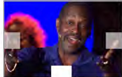
play VIDEO Alive and Kickin', part one