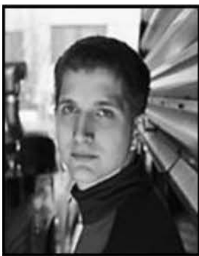
Chief Security Officer, Internet Corporation for Assigned Names and Numbers (ICANN)