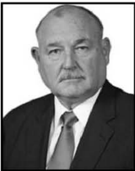
Retired Commandant, U.S. Coast Guard

William H. Webster (HSAC Chair) served as the Director of the Central Intelligence Agency (CIA) from 1987 to 1991. Prior to his service as CIA Director, he served as Director of the Federal Bureau of Investigation (FBI) and as a Judge on the U.S. Court of Appeals for the Eighth Circuit. Judge Webster has been awarded the Distinguished Intelligence Medal, Presidential Medal of Freedom, and the National Security Medal. Following his tenure as CIA Director, Judge Webster worked with the law firm Milbank, Tweed, Hadley, & McCloy.