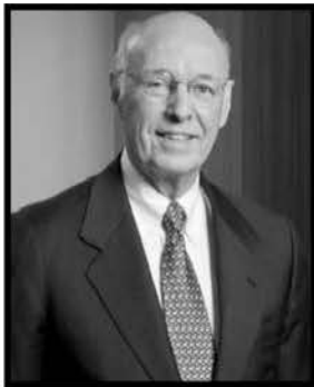
Chairman and CEO, MANATT Jones Global Strategies

Congresswoman Elizabeth "Liz" Holtzman is a former Representative for New York (Brooklyn) who sat in the 93rd to 96th Congress. While in office, she served on the House Judiciary Committee during the Watergate incident. Prior to entering office, she practiced law and managed parks and recreation as Assistant to New York City Mayor John Lindsay. She also cofounded the Brooklyn Women's Political Caucus. She was subsequently elected District Attorney of Kings County (Brooklyn), the only woman ever elected DA in New York City, in which she served for eight years. In May 2013, Secretary of Defense Chuck Hagel appointed Liz to the Response Systems to Adult Sexual Assault Crimes Panel. Elizabeth Holtzman currently serves as the co-chair of Herrick's Government Relations Practice.