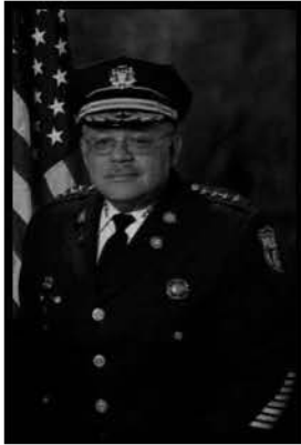
Police Commissioner, City of Philadelphia, Pennsylvania