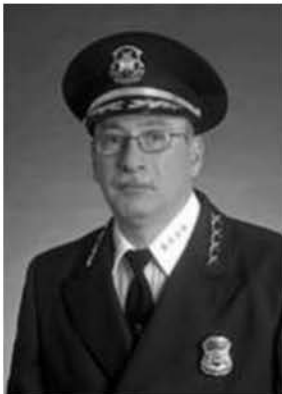
Chief of Police, Dearborn Police Department

Jane Holl Lute is currently the President and CEO of the Council on CyberSecurity and the former Deputy Secretary of the Department of Homeland Security. Previously, Ms. Lute was Assistant Secretary-General for Peacekeeping Operations at the United Nations with responsibilities for comprehensive personnel, finance, and logistical support to mount, direct, and sustain UN field-based peace operations world-wide. A retired officer from the U.S. Army, Ms. Lute holds a PhD in Political Science from Stanford University and a J.D. from Georgetown University Law Center.