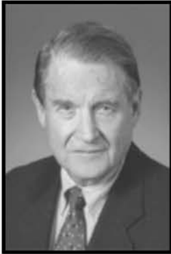
Ex-Officio Retired Partner, Milbank, Tweed, Hadley, and McCloy LLP

William H. Webster (HSAC Chair) served as the Director of the Central Intelligence Agency (CIA) from 1987 to 1991. Prior to his service as CIA Director, he served as Director of the Federal Bureau of Investigation (FBI) and as a Judge on the U.S. Court of Appeals for the Eighth Circuit. Judge Webster has been awarded the Distinguished Intelligence Medal, Presidential Medal of Freedom, and the National Security Medal. Following his tenure as CIA Director, Judge Webster worked with the law firm Milbank, Tweed, Hadley, & McCloy.