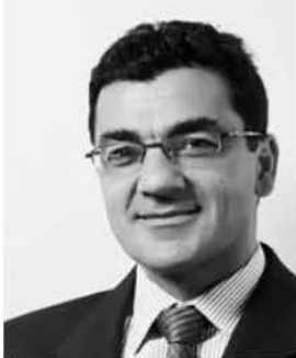
President, Muslim Public Affairs Council