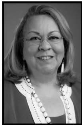
Retired Partner & CEO Noblis, Inc.