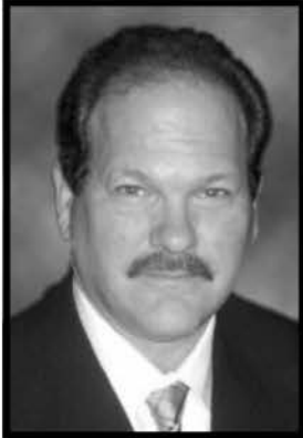
Co-Chair President and CEO, Cardinal Point Strategies, LLC