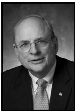
Retired Chairman and CEO, Lockheed Martin Corporation