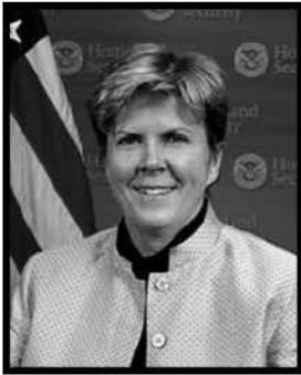
President and CEO, Cyber Security Council And Former Deputy Secretary of Homeland Security