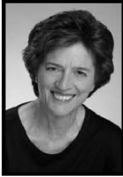
Former Congresswoman, Co-Chair of Herrick's Government Relations Practice.

Congresswoman Elizabeth "Liz" Holtzman is a former Representative for New York (Brooklyn) who sat in the 93rd to 96th Congress. While in office, she served on the House Judiciary Committee during the Watergate incident. Prior to entering office, she practiced law and managed parks and recreation as Assistant to New York City Mayor John Lindsay. She also cofounded the Brooklyn Women's Political Caucus. She was subsequently elected District Attorney of Kings County (Brooklyn), the only woman ever elected DA in New York City, in which she served for eight years. In May 2013, Secretary of Defense Chuck Hagel appointed Liz to the Response Systems to Adult Sexual Assault Crimes Panel. Elizabeth Holtzman currently serves as the co-chair of Herrick's Government Relations Practice.