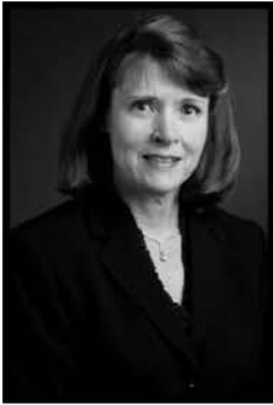
President and CEO, Analytic Services, Inc.