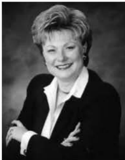
President and CEO, Analytic Services, Inc.