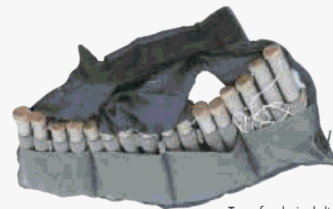
Type of explosive belt