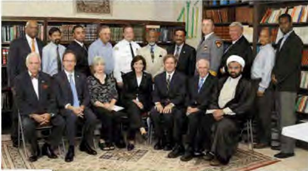
Speakers, Sponsors and members of the MPAC-WNY Board members at the 9/11 Event