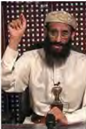
American and al-Qaeda member Anwar al-Awlaki addressing his followers through an online video.

On an extremist animal rights group website, there is a page of seemingly harmless jokes and cartoons. However, when coupled with the other messages advocating violent action to support animal rights and the associated content that is in constant view, the innocence of the humour fades away.