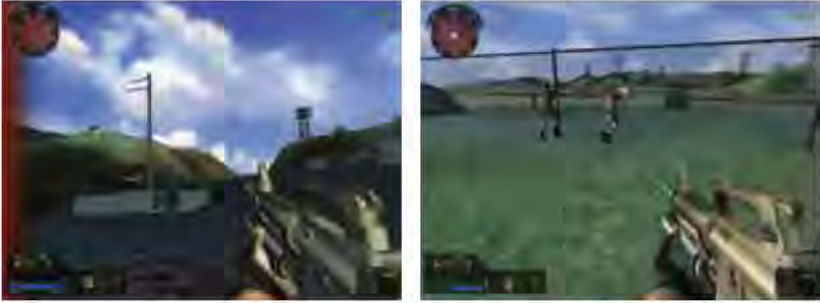
Screenshots from Hezbollah's Special Force 2 game in which players re-enact the attacks against Israel.

online entitled “Ethnic Cleansing” where the goal is to kill “subhumans,” while dressed as a member of the Ku Klux Klan or a skinhead. 44 In games from other groups, the objectives are to hunt down former U.S. President George Bush and other senior leaders, kill U.S. soldiers, or act as a member of Hezbollah attacking Israel. 45