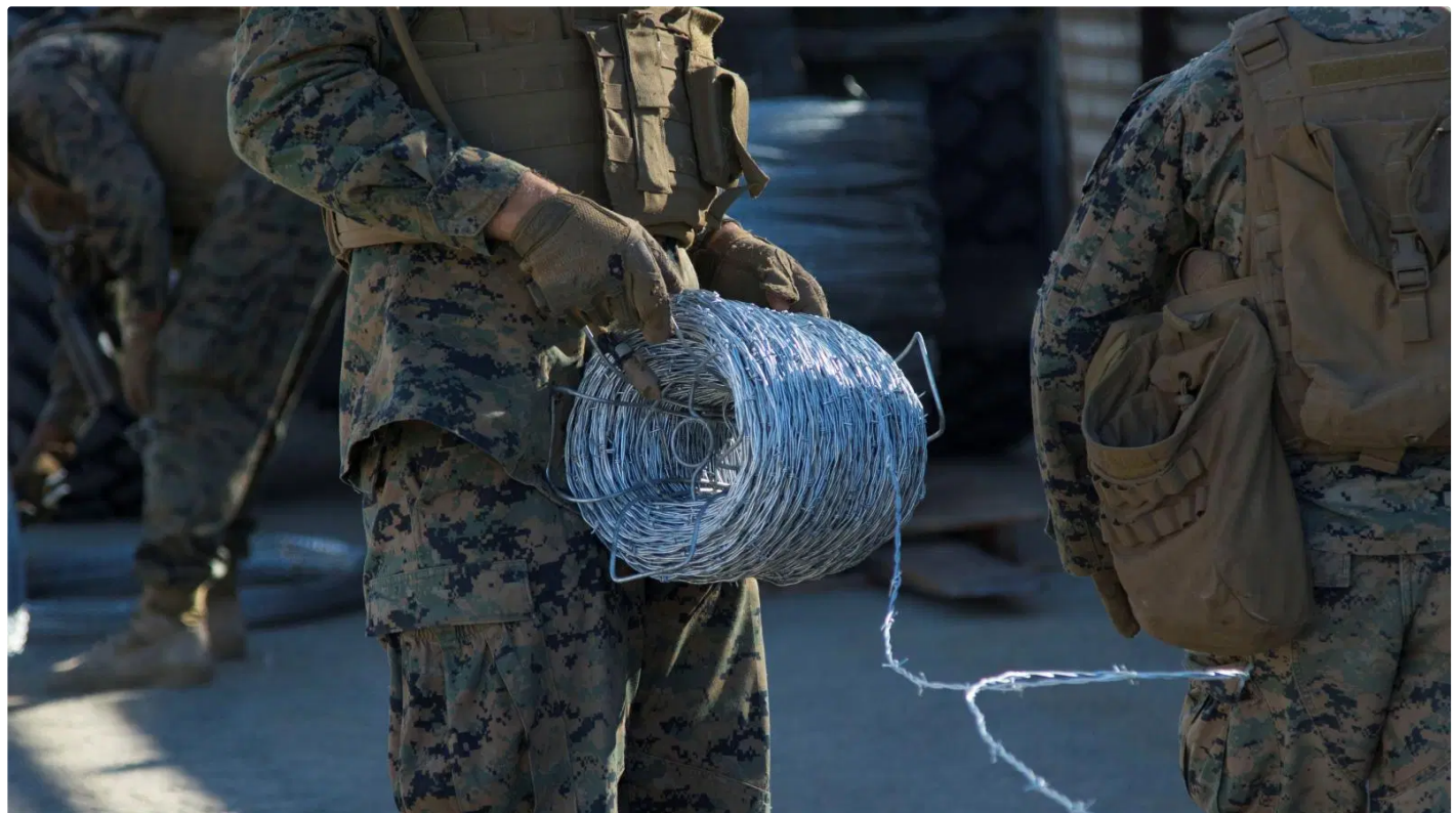
Special Purpose Marine Air-Ground Task Force 7 places concertina wire near Otay Mesa, California, November 27, 2018..

Congress members tasked with overseeing the US's massive military grilled Pentagon officials today (Jan. 29) on one of Donald Trump most controversial orders—sending troops to the border with Mexico to handle a caravan of Central American immigrants.