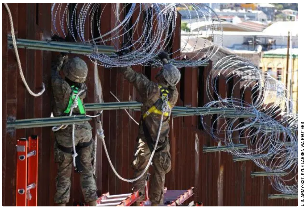
US soldiers at the DeConcini port of entry in Nogales, Arizona, November 27, 2018.

their way on foot through Mexico. Dubbed "Operation Faithful Patriot," the troops strung miles of concertina wire on fences on the Arizona and Texas border, even as many of the immigrants headed to a legal port of entry in California.