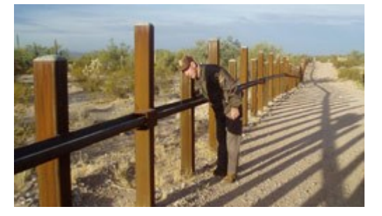
This steel fence is designed to stop car and truck traffic that drove from Mexico through the wilderness of Organ Pipe Cactus National Monument to enter into the United States illegally.

For the longest time, the only indication of an international border was stone obelisks placed every few miles across the border. Eventually a barbed-wire fence appeared to keep livestock and vehicles from entering the desert wilderness of Organ Pipe Cactus. In the mid-1900s, the land surrounding Organ Pipe Cactus became prime corridors for illegal trade due to its rugged terrain, yet close proximity to major metropolitian areas. To avoid detection, many individuals began illegally driving through the barbed-wire fence.