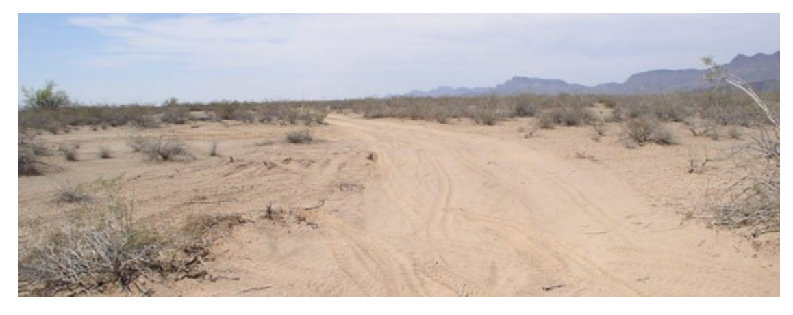
The damage left behind by vehicles traveling through the sensitive desert wilderness is lasting and detrimental to native plant and animal species.

In 2006, the NPS finished building thesteel fence. Although the three-year construction project was costly, the natural and cultural resources it has protected are priceless. It also provides positive value to visitor safety, officer safety, and our national security.