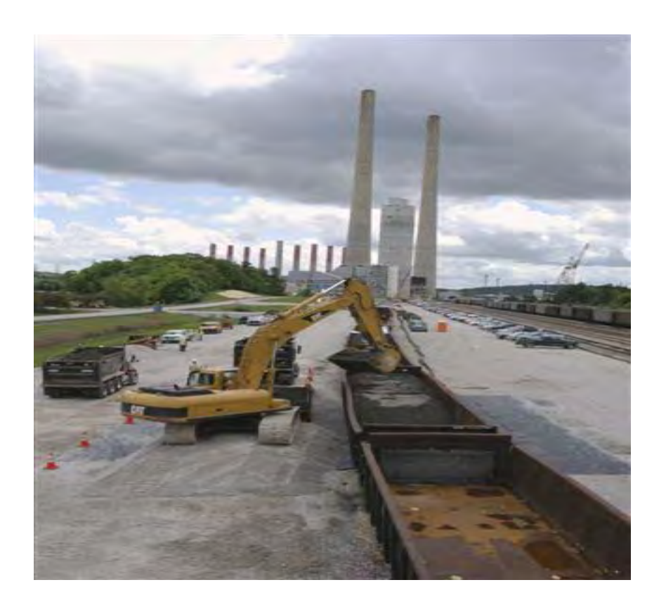
Loading rail cars at Kingston.