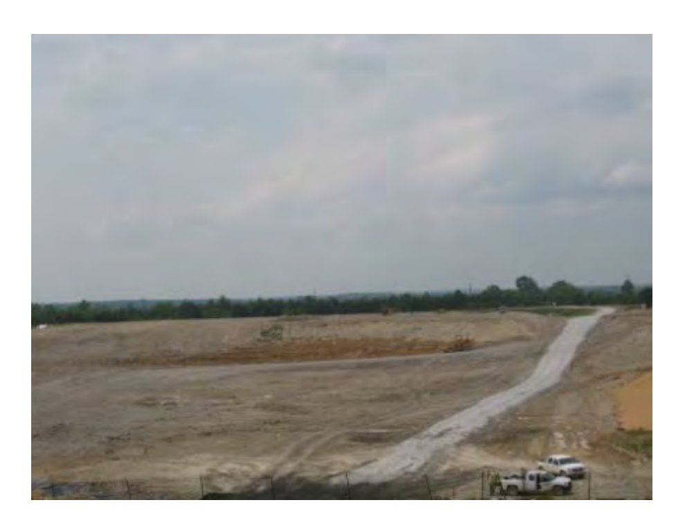
Active disposal cell at the Arrowhead Landfill in Uniontown, AL