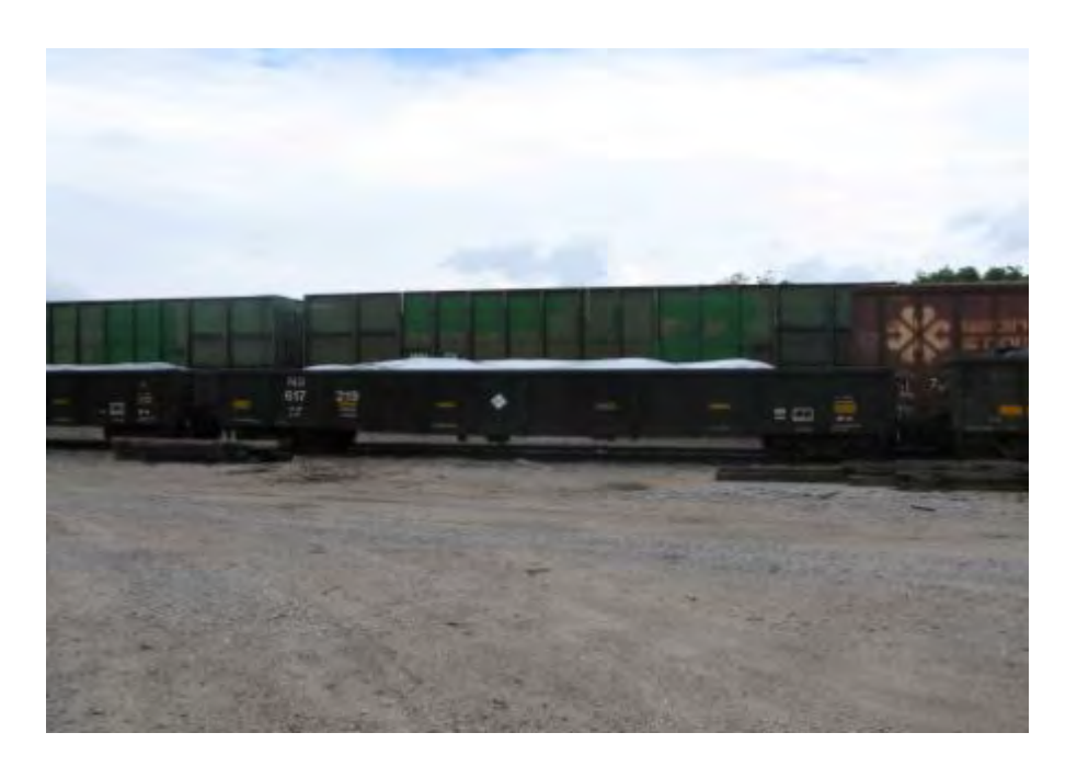
Loaded train. The gondola cars are much lower than standard bottom dump or rotary dump cars.