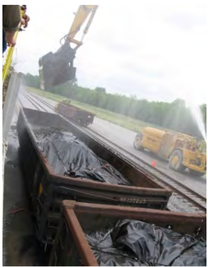
Unloading cars at Arrowhead Landfill. A water truck was used to simulate unloading during a heavy rain.