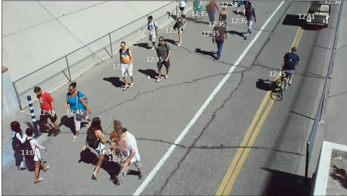
Stills from BriefCam promotional video 140

The application of AI to video search is significant because it can extend the same chilling effects and potential for abuse to cameras that aren't equipped with analytics, as well as to online video or other caches of footage collected in the past by "dumb" surveillance cameras.