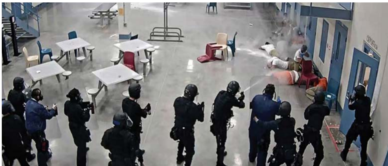
LPCC staff firing pepper spray and chemical agents at detainees in an LPCC housing area on April 13, 2020.

ICE, however, failed to take the most basic precautions to protect detained people in its care, a disproportionate number of whom are Black and Brown people. 3 Immigrants in detention slept, ate, and bathed in crowded, unventilated housing units, often within arm's length of one another. In detention centers across the country, detained people begged for the basic means to protect themselves from the virus: soap, cleaning supplies, and masks. Yet, as the virus began to spread within detention facilities, ICE and its contractors—the