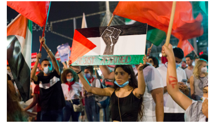
Protest against Netanyahu's plan to annex parts of the West Bank in July, Rabin square, Tel Aviv, June 6, 2020.

During the demonstrations in Tel Aviv and near the prime minister's residence in Jerusalem in October 2020, the police employed the practice of “kettling”, whereby officers corral demonstrators by linking hands or using barriers, thereby pushing the protestors into a contained and confined area. Those imprisoned in this manner during the Balfour demonstrations included elderly people, children, and journalists covering the demonstrations. People were trampled due to the high level of congestion, they experienced anxiety attacks, and they were forced to relieve themselves behind trees and garbage cans. By law, the authority of the police is confined to restricting the freedom