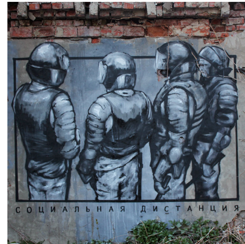
RUSSIA Nikita Nomerz, “Social distance,” Urban Art Mapping: Covid-19 Street Art , accessed March 29, 2021.

In Russia, the Parliament approved a law allowing the federal and regional authorities to enact unchecked restrictions on human rights in the course of a so-called “high alert preceding a situation of emergency”. This vague regime of “high alert” was used instead of the pre-existing “quarantine”, “situation of emergency”, and “state of emergency,” all of which had more precise legal frameworks. In both of these cases, these efforts to expand and consolidate power are not a departure from, but rather a continuation of, the current government’s authoritarian tendencies.