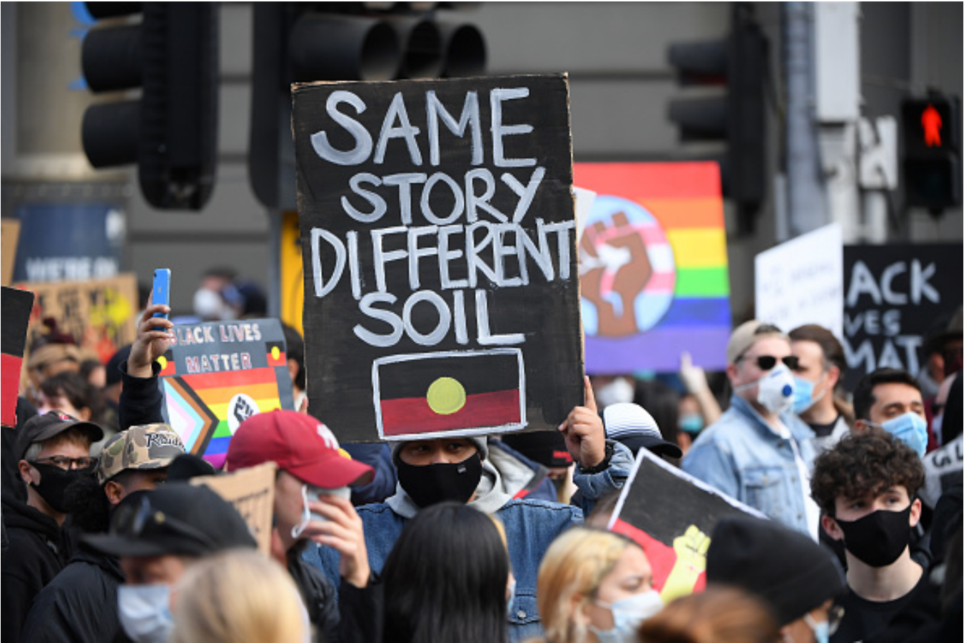
Protesters at a Black Lives Matter rally in Melbourne in June 2020.

In June 2020, massive Bla(c)k Lives Matter (BLM) / Aboriginal Lives Matter protests took place across Australia, involving tens of thousands of protesters. Although organizers took extra measures to allow social distancing, government officials condemned the protests, including the Australian Prime Minister who made a statement that protestors marching for BLM threatened the country’s economic recovery from the pandemic and should be charged if they marched . Some government ministers suggested that BLM protesters should lose social security payments, with one minister calling for protesters to return health related payments in advance of attending the protests . This statement came just days before