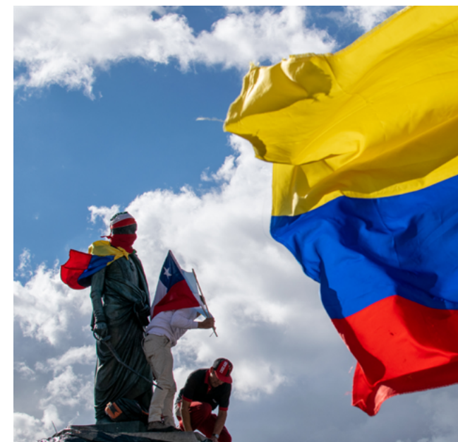
Demonstrators in Plaza de de Bolívar in Bogotá during the National Strike.

In Israel, discrimination in the exercise of enforcement powers and racial profiling is not a new phenomenon. For many years, the police have adopted a hardline policy toward protestors from minority groups — particularly Arabs, members of the Ethiopian community, people of Mizrahi appearance, and Haredim — who are automatically regarded