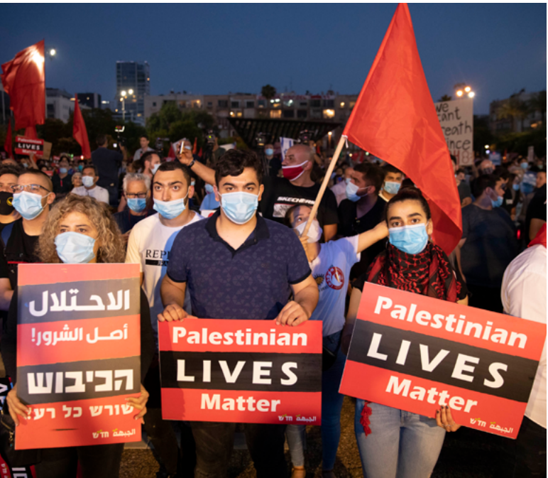
Around 6000 Israelis and Palestinians protest against Netanyahu's plan to annex parts of the West Bank in July, Rabin square, Tel Aviv, June 6, 2020.

Among other practices, the police extensively enforced the offence of “refusal of an instruction to disperse a gathering”. Many protestors and passers-by were given fines despite no order to disperse being issued. At demonstrations in Tel Aviv, protestors were fined in instances when the police itself surrounded them and blocked their exit and egress (known as the “kettling”). Demonstrators who organized protests were often fined when they did not present any risk of infection or any danger of any other kind to the public. As early as March 2020, significant fines were issued to hundreds of demonstrators who participated in a convoy to Jerusalem and the Knesset protesting parliamentary and political developments. The fines were issued at dedicated roadblocks established by the police for this purpose. The result of these policing practices during the pandemic is the unjustified denial of demonstrators’ liberty, their stigmatization as lawbreakers, and the deterrence of citizens from participating in the protests.