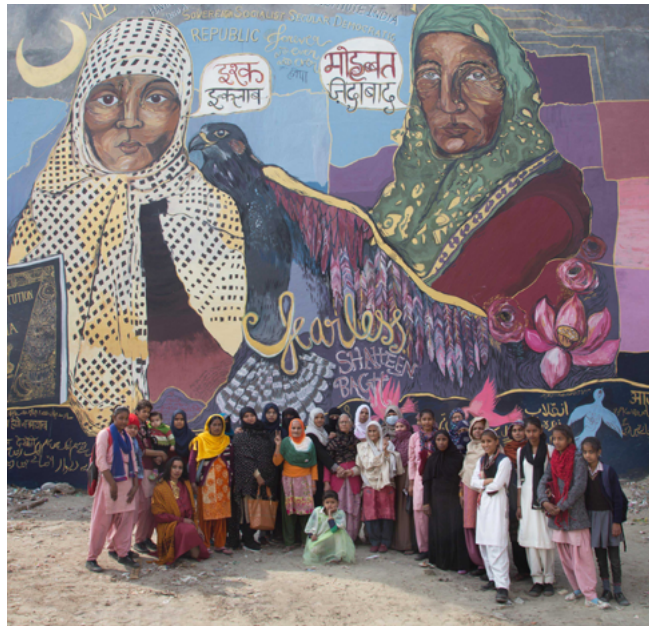
The Fearless Collective is a group of women who street art with local communities.