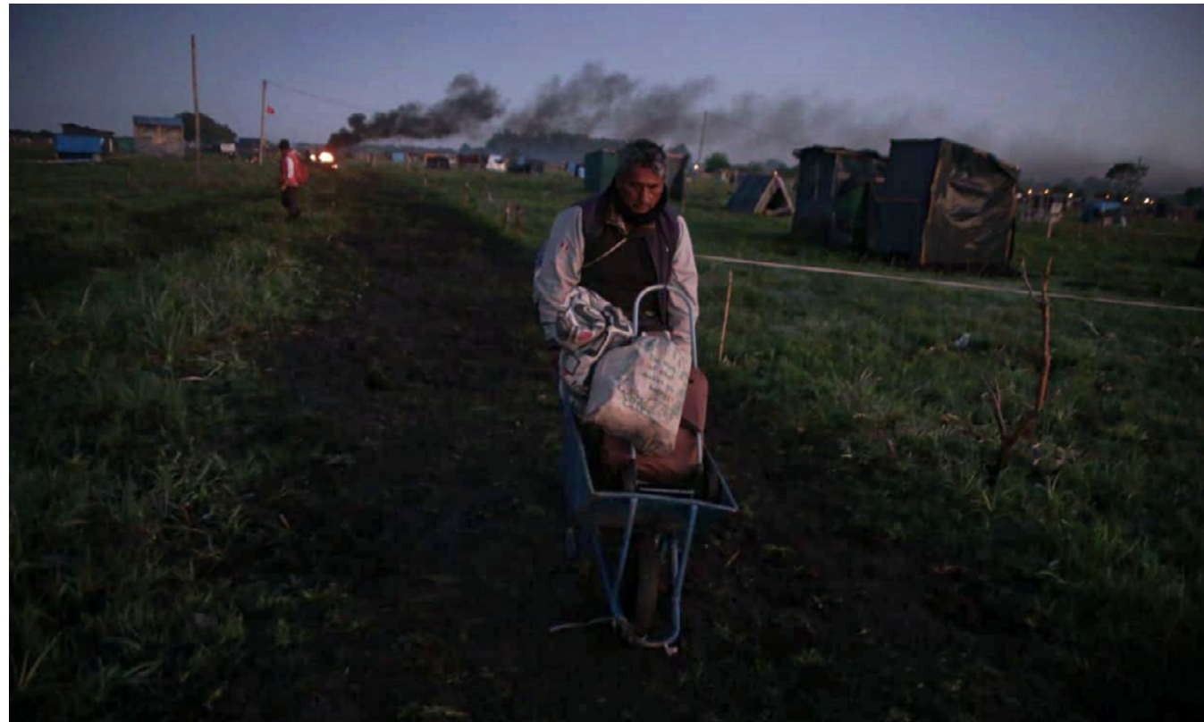
In Argentina, in late-October, about 1 400 families living in the informal settlement, Guernica, were evicted and their homes destroyed and burned by law-enforcement officers.