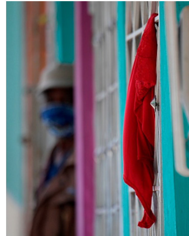
People ask for food with red rags hanging from their windows on a poor neighborhood on April 25, 2020 in Bogotá, Colombia.

officers. Over 4 000 police officers were involved in the removal of Guernica residents, which included families with children. Many of the residents were removed violently and with the use of pepper spray and rubber bullets. 46 residents were detained. Since the end of July, over 2 500 families — previously homeless or in precarious living situations — had settled in this private land in the periphery of Buenos Aires, although the majority had already agreed to reallocate. CELS and other human rights organizations criticized the handling of the situation, stating that it failed to address the economic and housing crisis the Guernica settlement embodied and that the forced eviction ignored ongoing dialogue that civil groups were facilitating between residents and the provincial government authorities.