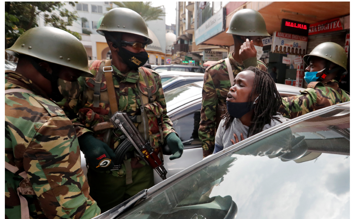
An activist is detained by security forces during anti-government protests dubbed "Saba Saba People's March", in downtown Nairobi, Kenya July 7, 2020.

with a reckless disregard for its truth or falsehood with intent to obstruct or prevent the effectiveness of protective measures could be punished with one to five years of imprisonment. Uncertainty about the wording of the measure and the expansion of its applicability beyond scenes of public danger resulted in a chilling effect on critical views on the effectiveness of the pandemic-related governmental measures. Shortly after its commencement, the Hungarian police started to apply the new rule in a demonstrative way : two citizens, one of them an opposition activist, who expressed their opinion on social media had their homes raided and were arrested for scare-mongering. Though the prosecutor decided not to prosecute, the police still published its recordings of the