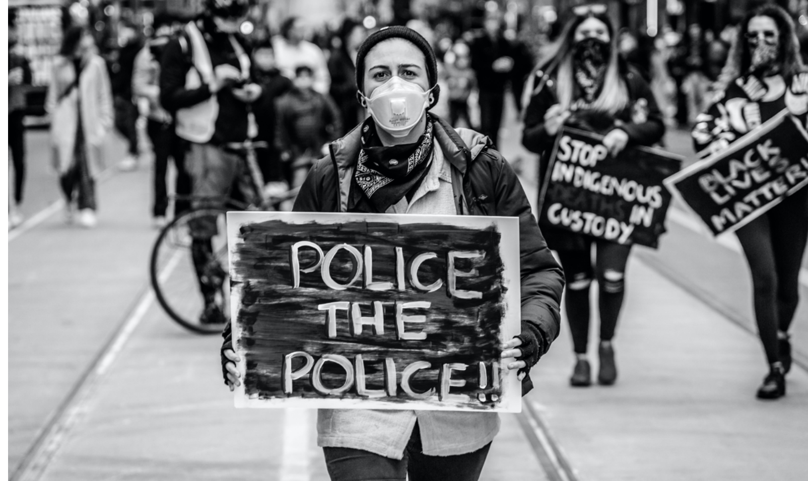
Melbourne, Victoria, Australia, June 6th, 2020: A woman is carrying a homemade placard to a Black Lives Matter street protest.

Protests in prisons during the pandemic have highlighted the vulnerability of incarcerated populations who already faced health risks due to overcrowding and unsanitary living conditions.