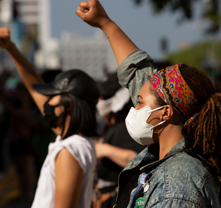
Los Angeles, California / USA - May 28, 2020: People in Downtown Los Angeles protest the brutal Police killing of George Floyd.