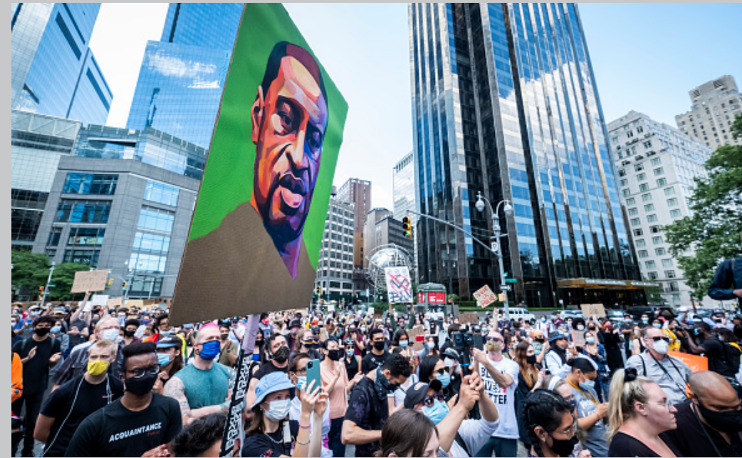
George Floyd Protest Donald Trump Birthday Protest - New York City

A large majority of countries issued measures in response to the COVID-19 pandemic that placed bans or severe restrictions on public assemblies and thus impacted the right to protest. Protests have continued to take place, with some respecting social distancing guidelines. Protests have mobilized people from a wide political spectrum and communicated discontent related to issues ranging from ineffective pandemic responses, economic hardships occasioned by the pandemic, and ongoing police brutality to discontent instigated by conspiracy theories and far-right rhetoric. Civil liberties and human rights groups have raised concerns about ineffective approaches to the pandemic that have, in certain cases, led to the selective enforcement of criminal charges, fines, and other penalties by governmental authorities towards protesters, and in others, the enforcement of lockdowns that create blanket bans on protests.