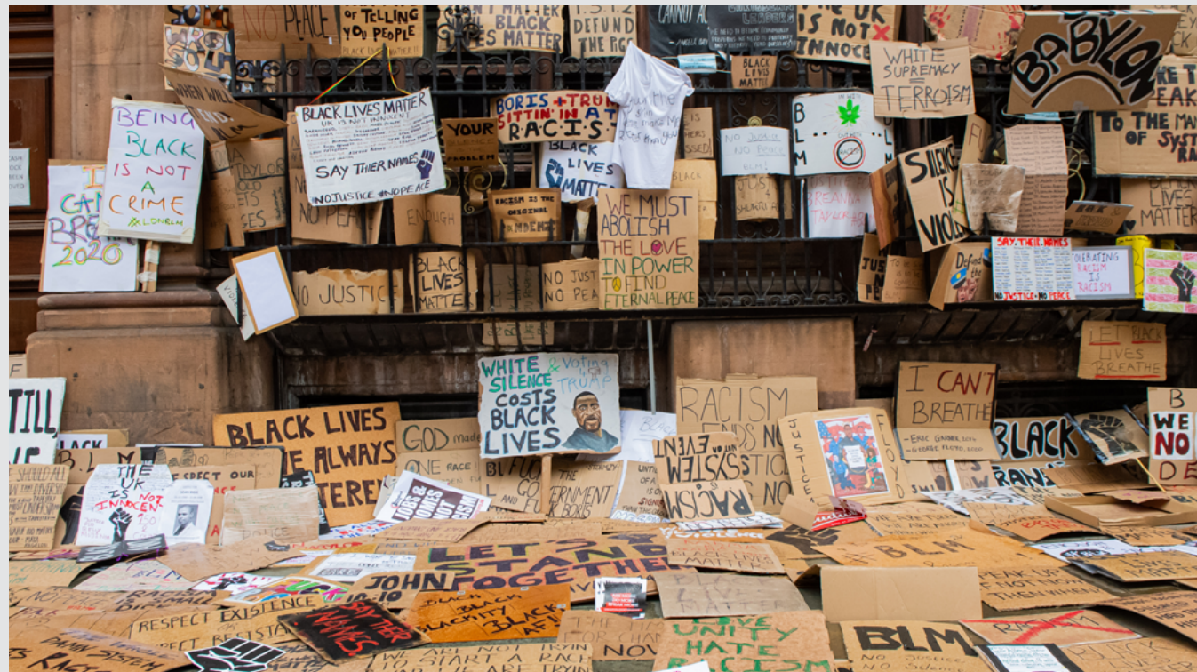
INDONESIA "Untitled (Person with gas mask and hard hat)," Urban Art Mapping: Covid-19 Street Art , accessed March 29, 2021.