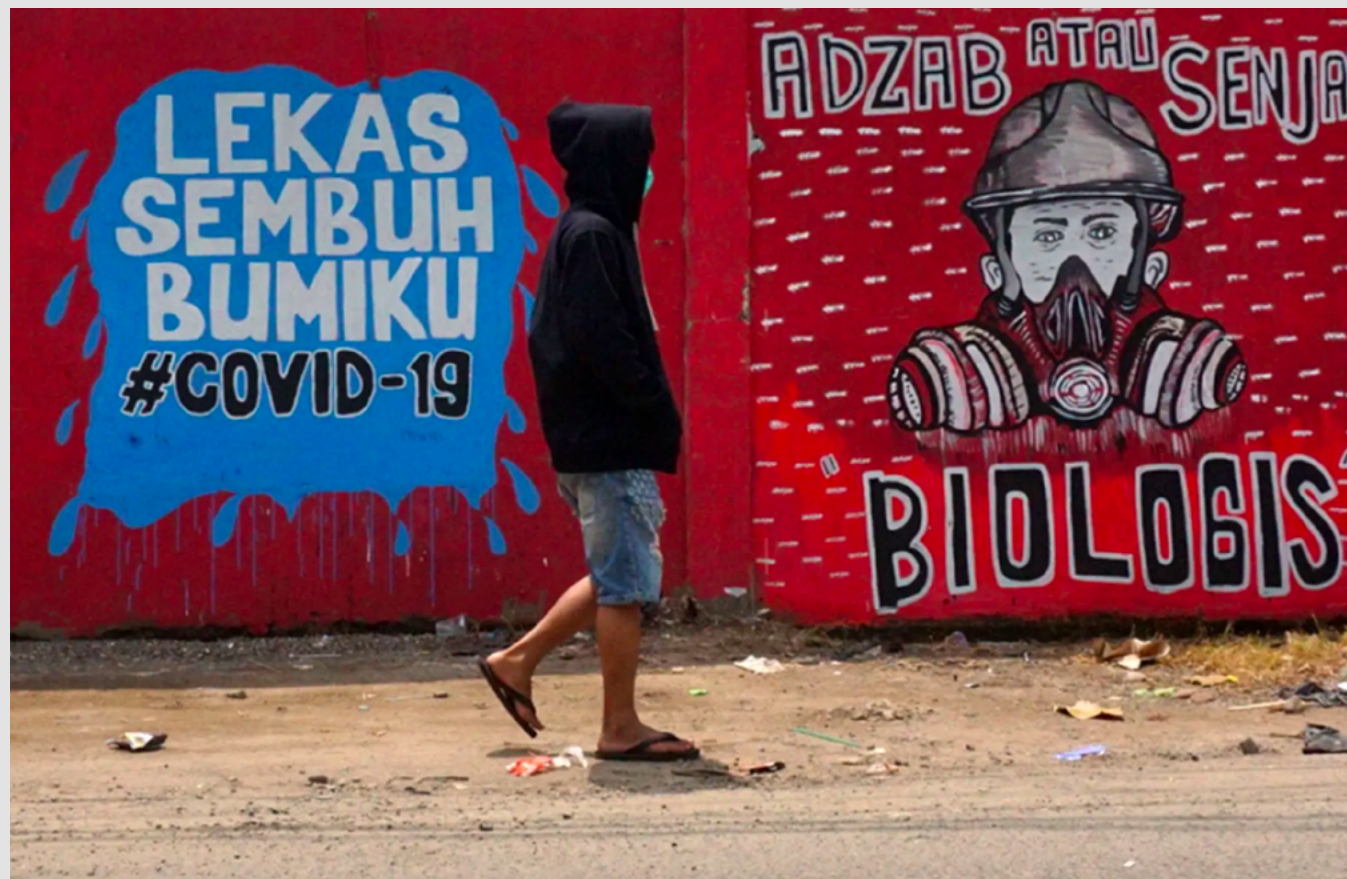
INDONESIA "Untitled (Person with gas mask and hard hat)," Urban Art WWMMapping: Covid-19 Street Art , accessed March 29, 2021.