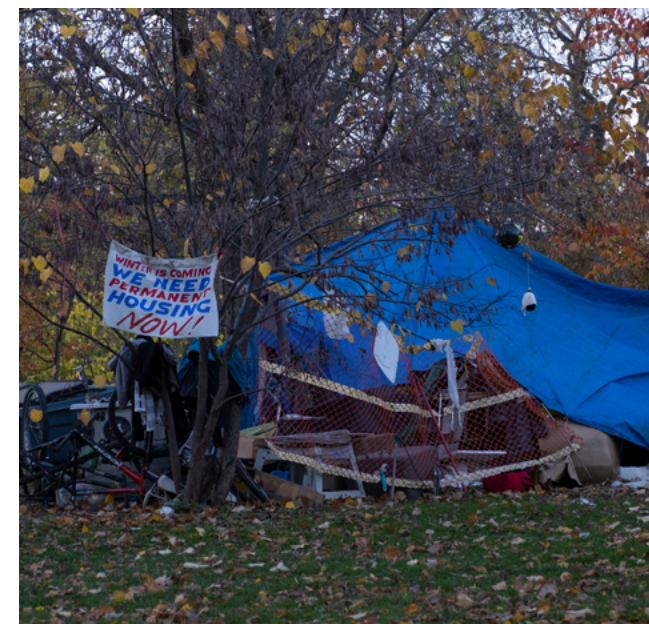
Toronto, Canada - Oct 27, 2020: Sign winter is coming we need permanent housing now at homeless tent camp at Trinity Bellwoods Park.

In Colombia, the relationship between socioeconomic inequality and police abuse has become even more pronounced during the pandemic. After heavy police repression occurred during #9S protests on 9, 10 and 11 September 2020, CeroSetenta, an independent digital journalism platform, conducted an investigation using more than 200 videos collected on social media that indicated that police disproportionately used excessive force when responding to demonstrations in middle-class or poor neighbourhoods. Data regarding shots fired and people injured and killed by police were consistent with the trends found in investigations carried out by Dejusticia in 2013 and 2015, both focused on police forces, security, and inequality. These