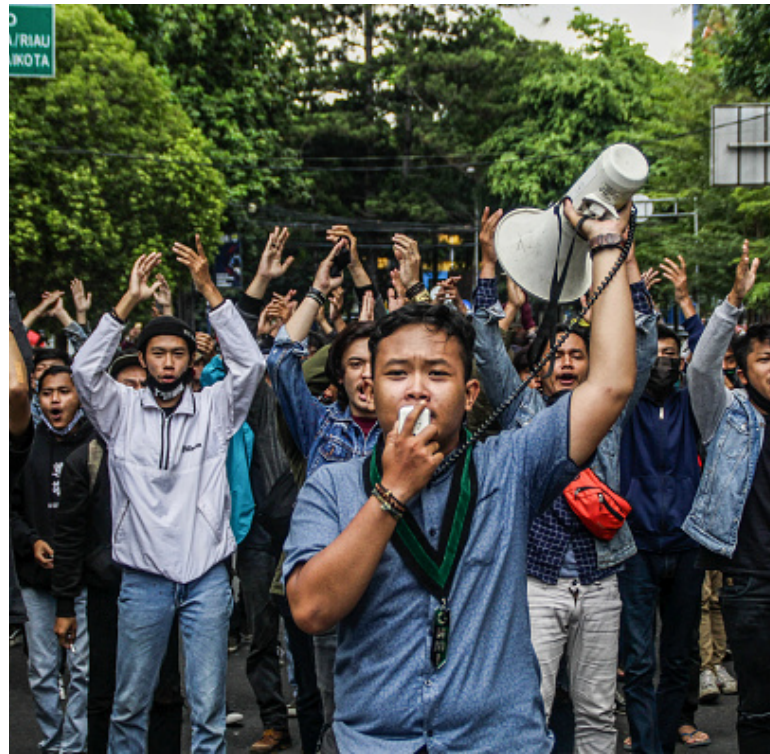
Students protested against the government's omnibus bill on job creation that was intended to boost economic growth and create jobs, which they believe will deprive workers of their rights and undermine the environment in Indonesia.

In Surabaya, the police confiscated several cameras and phones and also deleted the documentation of protests from several civilians and journalists . During the protest, at least eight journalists underwent intimidation and confiscation of documentation tools.