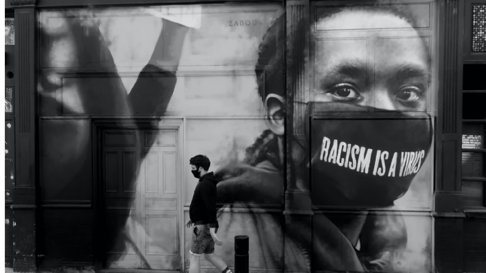
LONDON Zabou, "Racism is a virus," Urban Art Mapping: Covid-19 Street Art, accessed April 8, 2021.

Amidst the COVID-19 pandemic, police failures to facilitate peaceful protests (including by refusing to wear masks ) also increased health risks for police, protesters, bystanders, and the community at large. Specific police tactics like kettling — essentially trapping protesters and bystanders into a limited, often crowded area with only one point of exit controlled by officers — were even more troubling during a pandemic because they heighten the risk of infection by forcing large numbers of people closer together. Similarly, arresting protesters and holding them overnight would likely exacerbate the spread of COVID-19, pushing more people into jails that had become hotbeds of infection. And public health experts cautioned that the use of particular police weapons, including tear gas and pepper spray, could heighten COVID-19 risks by causing people to cough and gasp for air.