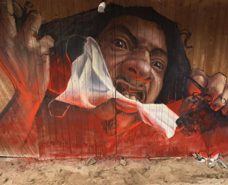
PERU Artist: Huansi (@huansii), "Asfixiado [Suffocated]," Urban Art Mapping: Covid-19 Street Art , accessed April 8, 2021.