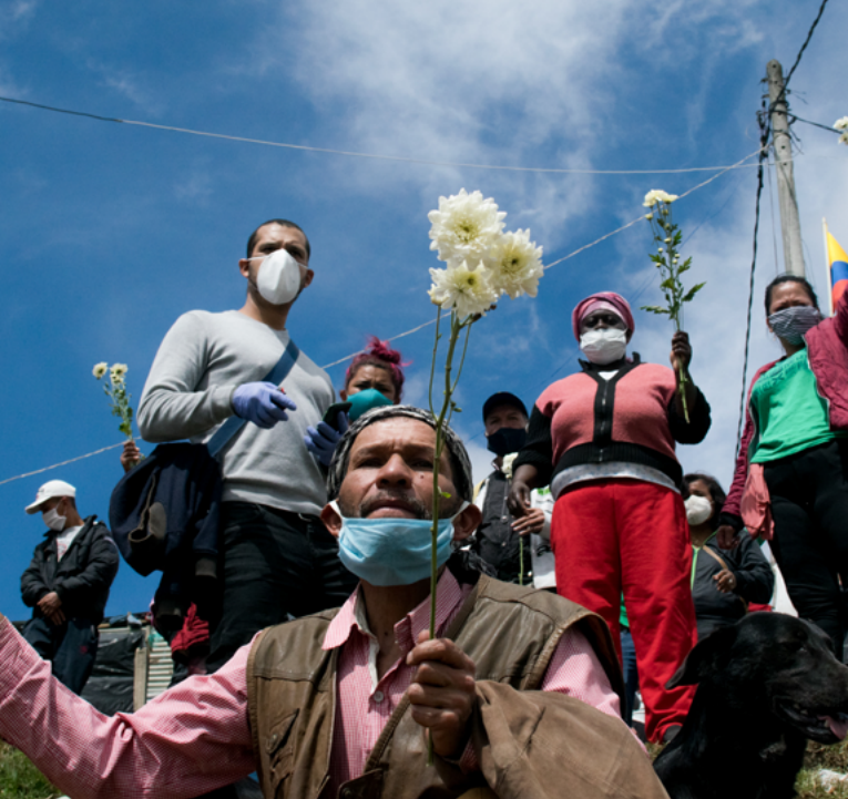
Residents of Altos de la Estancia, to the south of Bogotá, during a protest against the evictions from their homes. LIA VALERO

during the coronavirus lockdown has led to the discriminatory use of tasers and stop and searches on communities of colour . In London, levels of stop and search rose to their highest in over seven years.