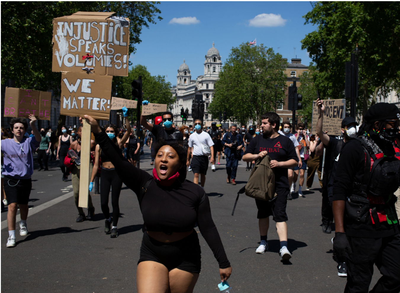
A woman protests the death of George Floyd in Mineapolis.

In the United Kingdom, unclear lockdown regulations — brought in unnecessarily using emergency powers and without effective parliamentary oversight — have been used by police to restrict the right to protest . As a result of the government’s refusal to allow and facilitate protests during the lockdown, people’s administrative law rights to challenge these decisions have been undermined and protesters have been criminalized and intimidated. Threats of prosecution of protesters were made by government officials after the removal of a slave trader statue by protesters in Bristol, which sparked counter-protests from conservative groups. Ministers indicated they would support extending