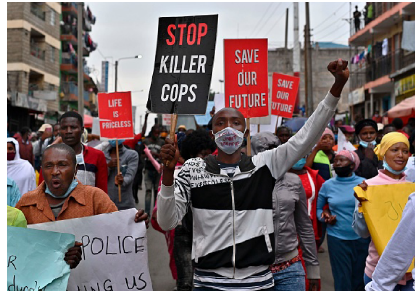
A demonstrator gestures while holding a placard during a demonstration against what they term as arbitrary police killings in the Mathare slum in Nairobi on June 8, 2020.

In the United States, local, state, and federal law enforcement agencies have responded jointly to nationwide protests against police brutality, including with the deployment of