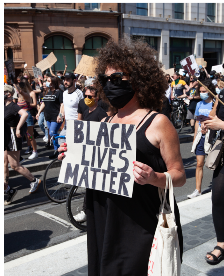
Dublin, Ireland - 1 June 2020 : Thousands of people marched through Dublin in solidarity with Black Lives Matter protesters in the United States.

These policies and instructions were not consistently applied by law enforcement. The police used pandemic restrictions on gatherings to disperse several protests against special autonomy in Papua and a protest regarding minimum wages in Batam . In contrast, several gatherings organized by public officials were not forcefully dispersed, including a concert arranged by the head of a Regional People's Representative Office in Tegal, Central Java . The Indonesian government also decided to hold simultaneous regional elections in 270 regions, which meant numerous gatherings for political campaigning. KontraS found that many gatherings during the election campaign period failed to strictly implement health protocols such as physical distancing and wearing masks.