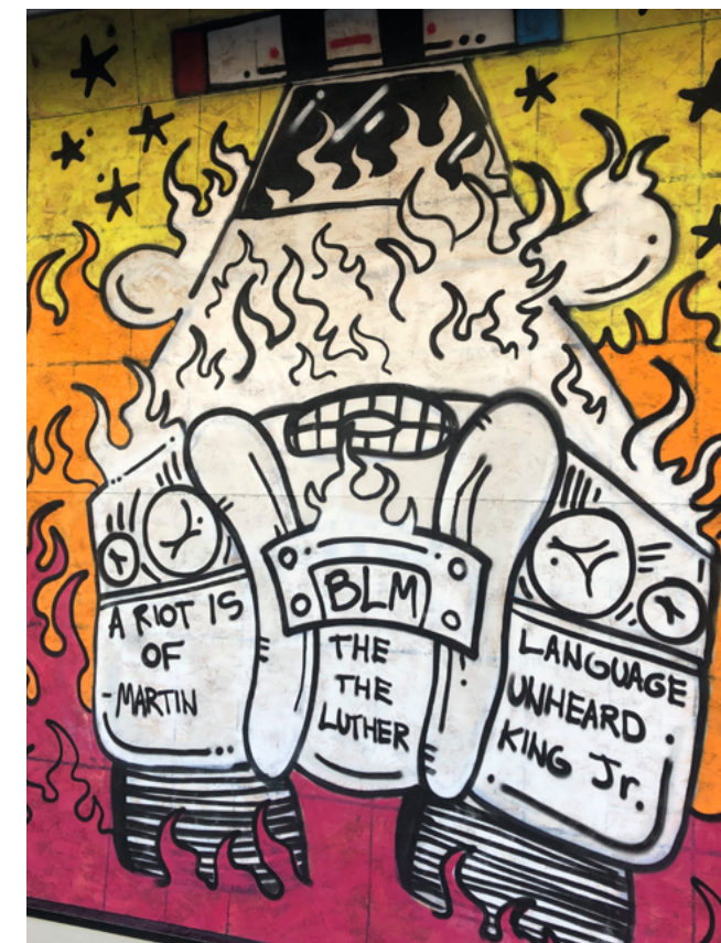
USA "BLM Cop Car: A Riot is the Language of the Unheard," George Floyd & Anti-Racist Street Art, accessed April 8, 2021.

investigations found that those most likely to suffer from police abuse were lower-income persons that identify as Black or indigenous and whose appearance is connected to an urban subculture.