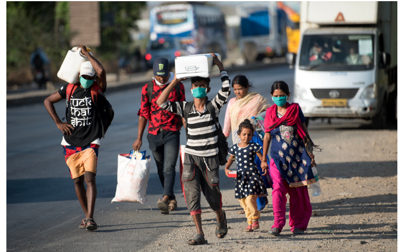
MUMBAI/INDIA - MAY 11, 2020 - Migrant workers walk on the highway on their journey back home during a nationwide lockdown to fight the spread of the COVID-19 coronavirus.

One of the most visible forms of abuse during the pandemic has been the violent and disproportionate uses of force by law enforcement and military personnel. This is not a new issue for civil liberties and human rights organizations, but it has recently regained visibility as these detrimental policing practices have disproportionately targeted members of racial or ethnic minority groups and other marginalized communities, and in many instances have heightened rather than reduced the risks of COVID-19 transmission . 6 The disproportionate use of force by law enforcement during the pandemic has also been a sign of a broader phenomenon: the militarization of domestic security. This was illustrated in places like Colombia and the United States, where both police and military forces were used to respond to protests, and in Kenya and South Africa where law enforcement used military armaments and training. The seriousness and exceptional nature of the COVID-19 crisis have been used to normalize security practices that could have long-term effects on civil and human rights.