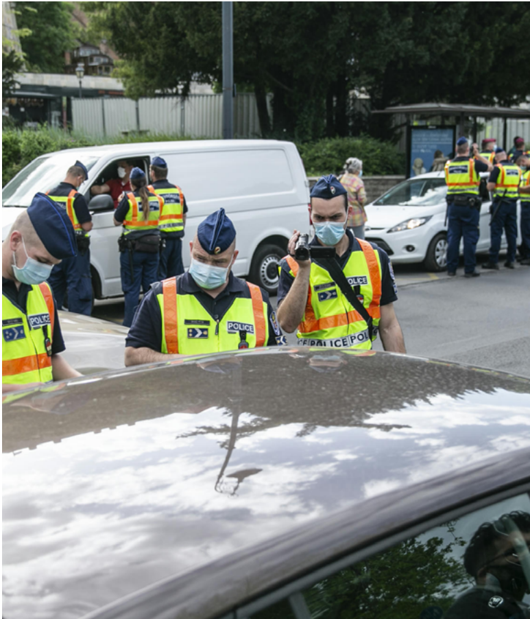
Lorem ipsum dolor sit amet, consectetur adipiscing elit. Lorem ipsum dolor sit amet, consectetur adipiscing elit.

In Hungary, the government introduced a general ban on protests allegedly to counter the COVID 19 pandemic. As a result, two independent Members of Parliament (MPs) and an opposition party called for a driving demonstration to protest the government’s decision to evict current patients to free up hospital beds as well as other failures in dealing with the health crisis . The first protest held on 20 April 2020 received little response from law enforcement. When the organizers called for weekly driving protests , police began cracking down and allocating excessive, and in some cases, repeated fines to protesters . The organizers finally decided to cancel the sixth protest after the overwhelming number of fines. Judicial reviews at the end of 2020 modified the fines to warnings. The crackdown on these protests that respected social distancing guidelines were in sharp contrast to the Hungarian government’s response to a protest organized by far-right groups that gathered several thousand people in Budapest on 28 May 2020 . The reasons for the different treatment of protests by law enforcement remains unclear, but it has undermined public confidence in the authorities and has led to uncertainty among citizens intending to protest in the future.