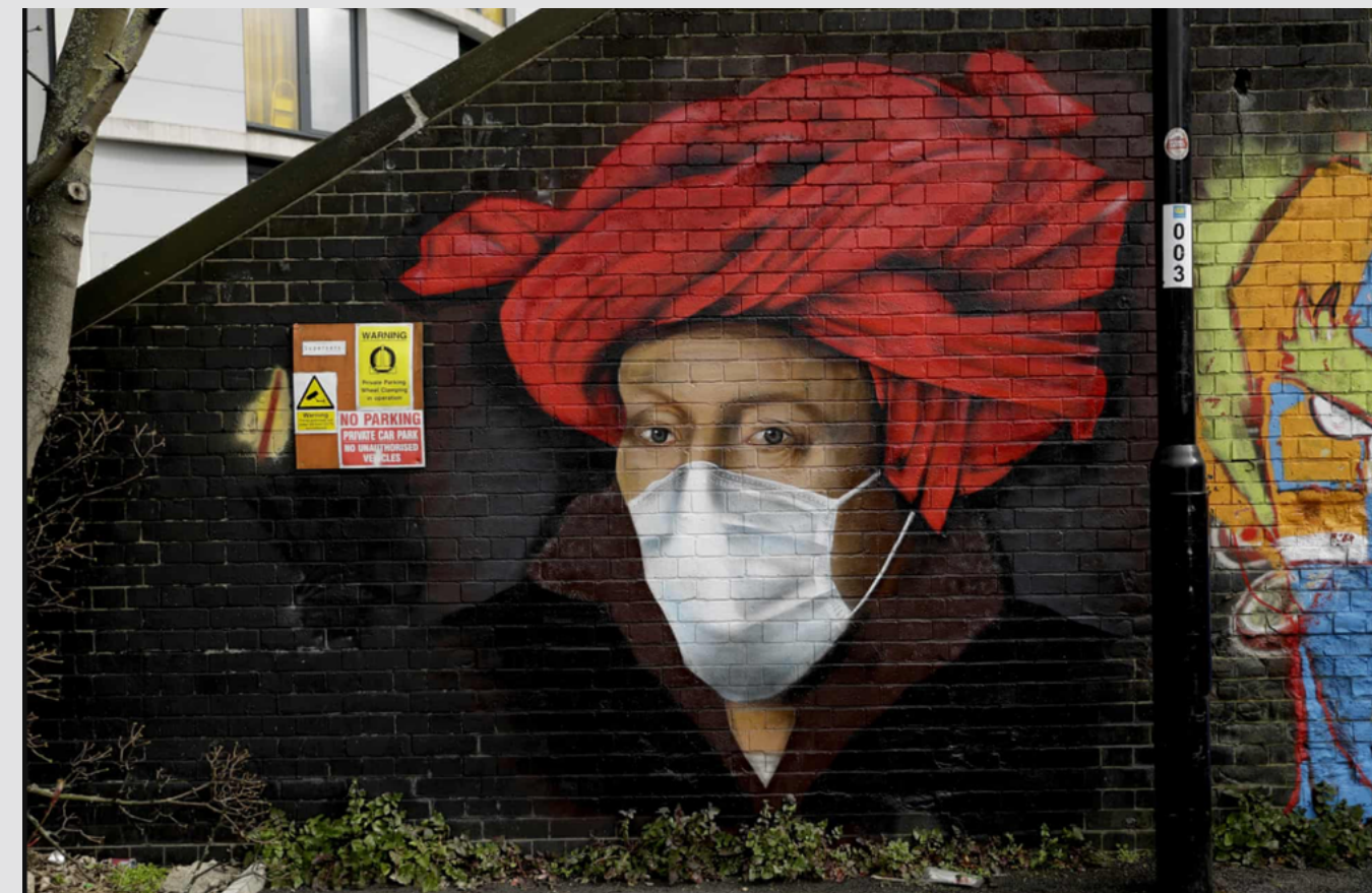
ENGLAND "Lionel Stanhope, "Untitled Mural (Van Eyck's Man in a Red Turban wearing a face mask)," Urban Art Mapping: Covid-19 Street Art , accessed April 8, 2021.

Agora organized online training sessions on how to address fines and other criminal proceedings during the pandemic.