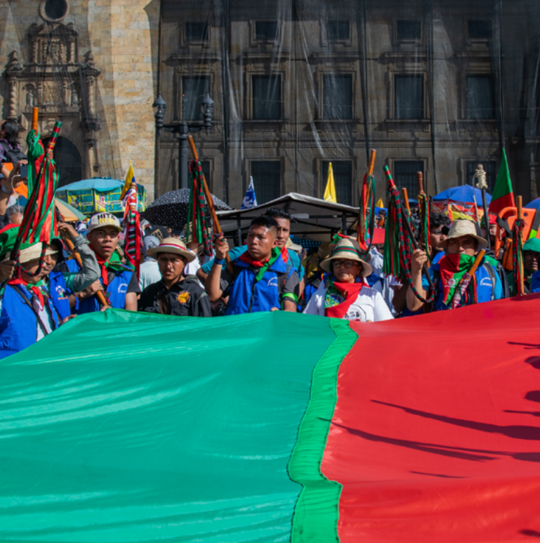
Arrival of the Indigenous Minga of the South-West to Bogotá, after mobilizing over 500 km starting in the Colombian Cauca. LIA VALERO