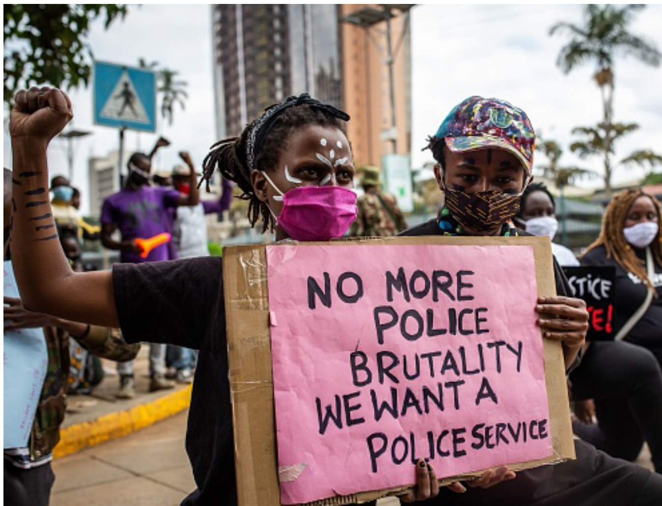
Protesters hold placards in front of the Kenyan Parliament during their protest against police brutality in Nairobi on June 9, 2020.

In Kenya, human rights groups criticized the abusive strategies used by police when enforcing the government pandemic response that included a nation-wide curfew. The day the nation-wide curfew was announced, police caused panic as they tear-gassed ferry commuters who were trying to get home before the curfew in Mombasa. The heavy-handed approach by the police came under even more scrutiny when a 13-year-old boy was shot and killed while watching police enforce the curfew from the balcony of his home.