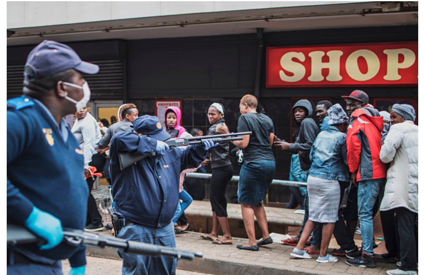
A South African policeman points his pump rifle to disperse a crowd of shoppers in Yeoville, Johannesburg, on March 28, 2020 while trying to enforce a safety distance outside a supermarket amid concern of the spread of COVID-19 coronavirus.