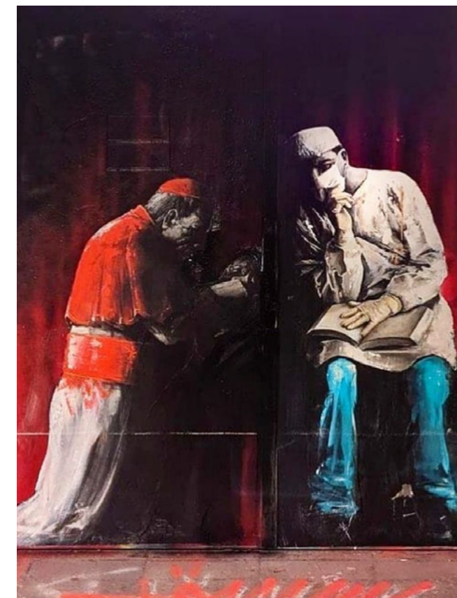
ENGLAND Artist: Tommy Fiendish (@tommyfiendish) "Fear and Salvation," Urban Art Mapping: Covid-19 Street Art, accessed April 8, 2021.

In the United Kingdom, Liberty warned that handing police broad powers to enforce restrictions on movement and gatherings during the pandemic, and urging them to use "their discretion" when applying them, would lead to communities of colour bearing the brunt of arbitrary policing. Analysis conducted