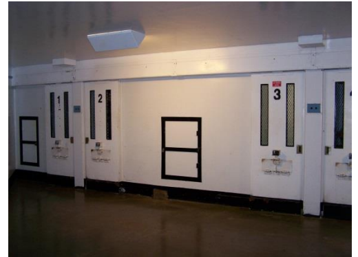
Texas' death row, where prisoners have spent an average of nearly 11 years before execution.

Death row prisoners spend years and years on death row for a number of reasons. The length of time is often needed for lawful appeals, but these processes are too often extended by serious breakdowns in our legal system; inadequate counsel for the poor; prosecutors' suppression of evidence favorable to defendants; ill-advised and illegal execution protocols; and the appeals, legal