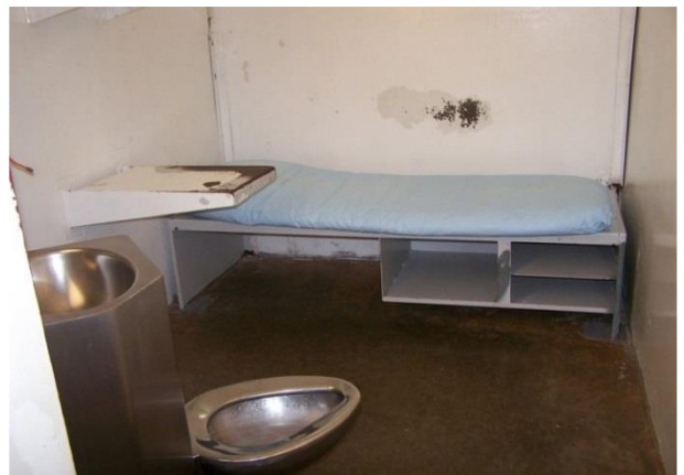
A solitary confinement cell on Texas’ death row.

Regardless of their stance on the death penalty, the people of the United States understand that a fair justice system must be a humane justice system. And by this measure, we are currently failing. It is time for reformers on both sides of the death penalty debate to recognize the hidden harms of solitary confinement inflicted on death row prisoners across the country. Solitary confinement is not part of the sentence. In order to build a criminal justice system that accurately reflects our values, we must end the routine use of solitary confinement of death row prisoners.