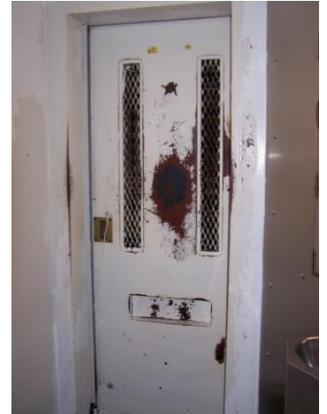
A solitary confinement cell on Texas' death row.

Despite the fact that Congress and the courts have recognized the importance of religious freedom in prison, death row prisoners are afforded little to no access to religious services. Indeed, 62 percent of states offer no religious services to death row prisoners and access to chaplains or other religious advisors is sporadic at best. This denial of such an important right enshrined in our Constitution and federal laws for condemned men and women raises troubling questions about capital punishment regimes nationwide. It is also likely to exacerbate the devastating effects of solitary confinement to which so many death row prisoners are subjected.