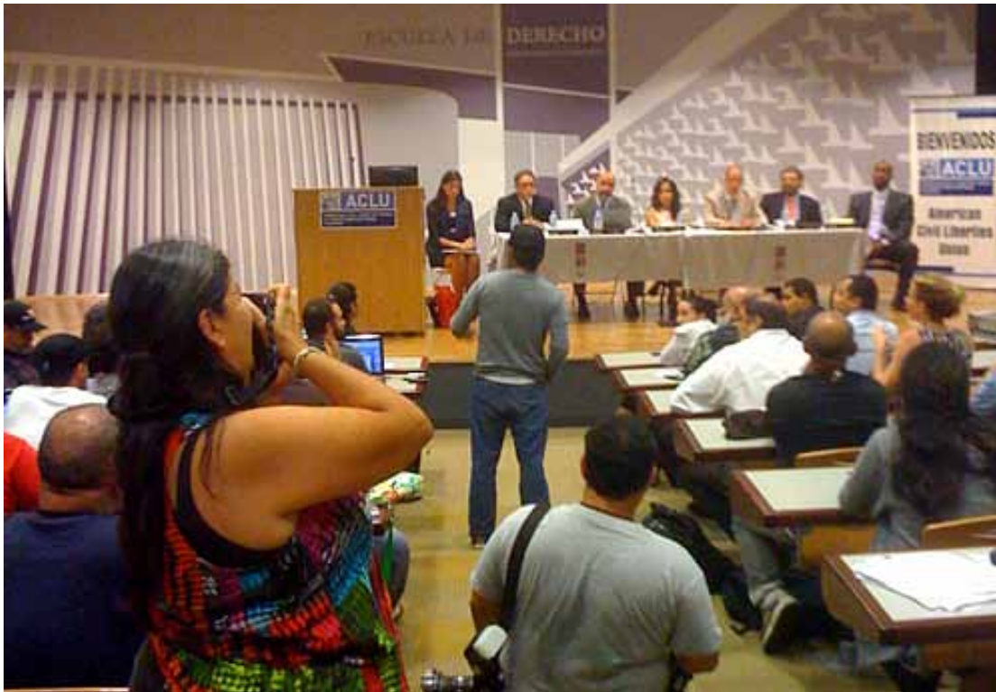
The ACLU convened a town hall meeting at the UPR School of Law, at which numerous UPR students provided testimony of the police abuse they have suffered.

This report is based on a comprehensive six-month investigation, during which the ACLU conducted interviews in Puerto Rico with government officials and victims of police brutality or their surviving family members or lawyers.