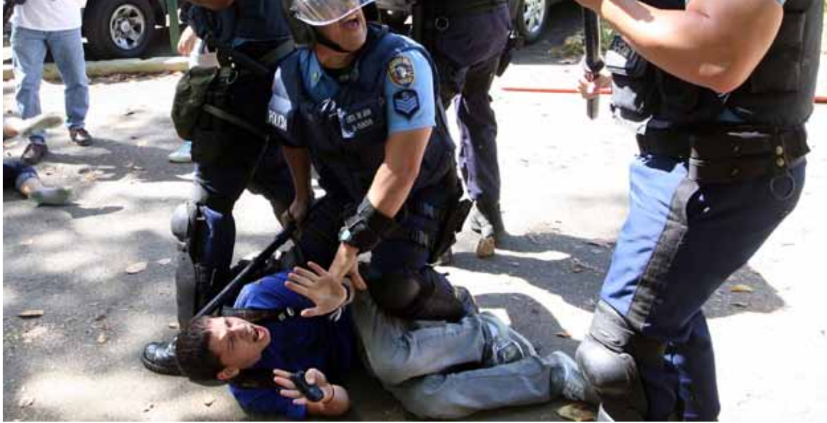
Police arrest a student on the University of Puerto Rico campus. The ACLU has documented baseless mass arrests of UPR student to put an end to their protests. A very small fraction of these arrests of student protesters was supported by probable cause.