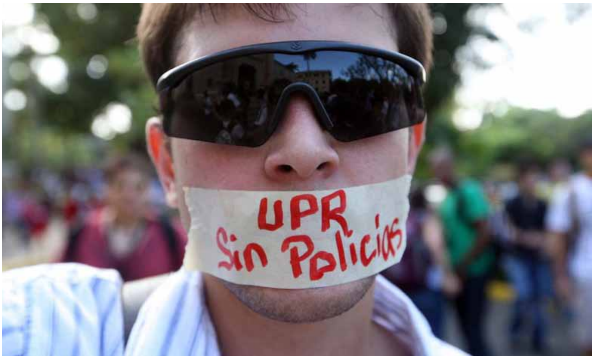
A protesting University of Puerto Rico student demanding the removal of police from the university campus. The tape on his mouth reads, "UPR Without Police."

Based on our research, including our findings identifying a number of problematic policies and practices that contribute to the pattern of police abuse in Puerto Rico, we have formulated clear recommendations for much-needed reforms. These reforms will not only help to bring the Puerto Rico Police Department into compliance with the constitutions of the United States and Puerto Rico and human rights laws, but will also help it to combat the public safety crisis it currently confronts.