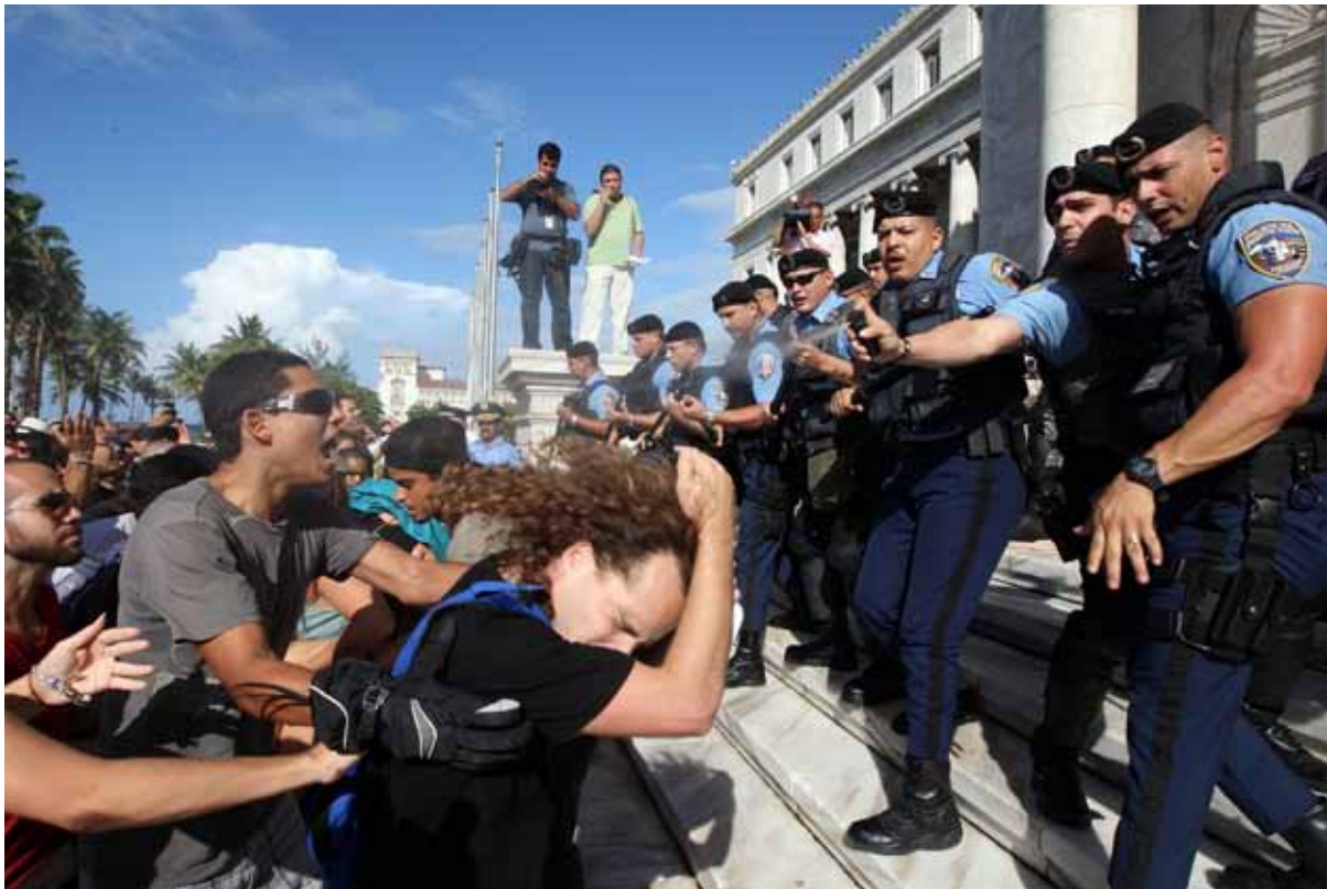
Riot Squad officers on the steps of the Capitol Building pepper-spray protesters during the June 30, 2010 mass public protest. Photo Credit: Andre Kang / Primera Hora (2010)

In responding to entirely peaceful or largely peaceful political demonstrations at locations that are traditionally the site of public protest in Puerto Rico, police have systematically used excessive force to suppress constitutionally protected speech and expression. The PRPD has regularly responded to protests by deploying scores of Riot Squad officers in full riot gear, who routinely struck protesters with batons, sprayed protesters with pepper spray at close range, fired tear gas indiscriminately, and used painful pressure point techniques on passively resisting students.