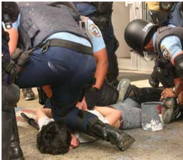
Injuries inflicted by police on UPR students during the February 9, 2011 student paint-in. Below left, police use excessive force to arrest a student during the peaceful protest.