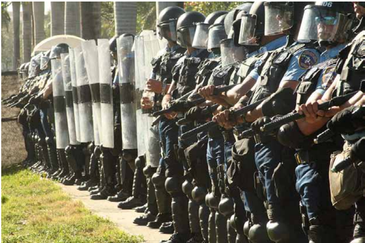
Riot Squad officers in formation outside the Capitol Building during a university student protest on January 27, 2011. Photo Credit: Indymedia (2011)

To its credit, the PRPD has retained a qualified team of experts to assist them with formulating new policies, which resulted in the issuance of a new general use of force policy at the end of January 2012. However, Puerto Rico's new use of force policy falls short of constitutional and U.S. national standards and has been criticized by civil rights and human rights advocates and policing experts as vague and lacking objective criteria on the use of lethal force by PRPD officers. An early draft of the use of force policy included the constitutionally mandated objective reasonableness standard, which was removed from the final version. Instead, the use of force policy currently in effect uses a simple reasonableness standard that allows officers' subjective judgment to determine the level of force that is