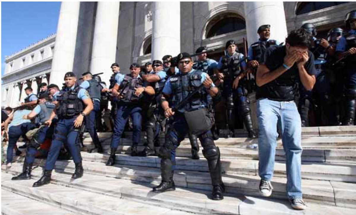
Riot Squad officers violently attacked protesters and independent and student journalists with pepper spray and batons on the steps of Capitol Building on June 30, 2010.

After a comprehensive six-month investigation of policing practices in Puerto Rico, building on eight years of work by the ACLU of Puerto Rico documenting cases of police brutality, the ACLU has concluded that the Puerto Rico Police Department commits serious and rampant abuses in violation of the United States Constitution, the Puerto Rico Constitution, and the United States' human rights commitments.