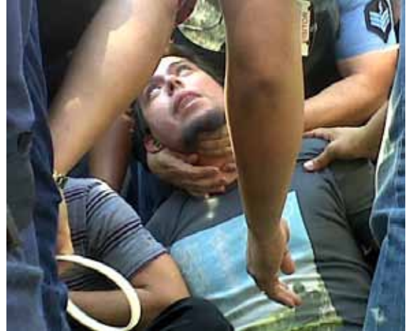
PRPD officers used painful pressure point techniques on passively resisting student protesters, in which officers targeted protesters' carotid arteries, under their jaws, near their necks, their ears, or directly on their eyeballs.

The students then moved onto Avenida Constitución, directly behind the Capitol complex, and some students began a sit-in on the public street, partially blocking traffic, while others continued to chant and hold placards. As soon as the smaller group of students began their sit-in at the Avenida Constitución, police officers began arresting those engaging in the sit-in one by one. The police never advised the students where they should move, and never told them they could protest in another location, but rather merely ordered them to “get out.” 260