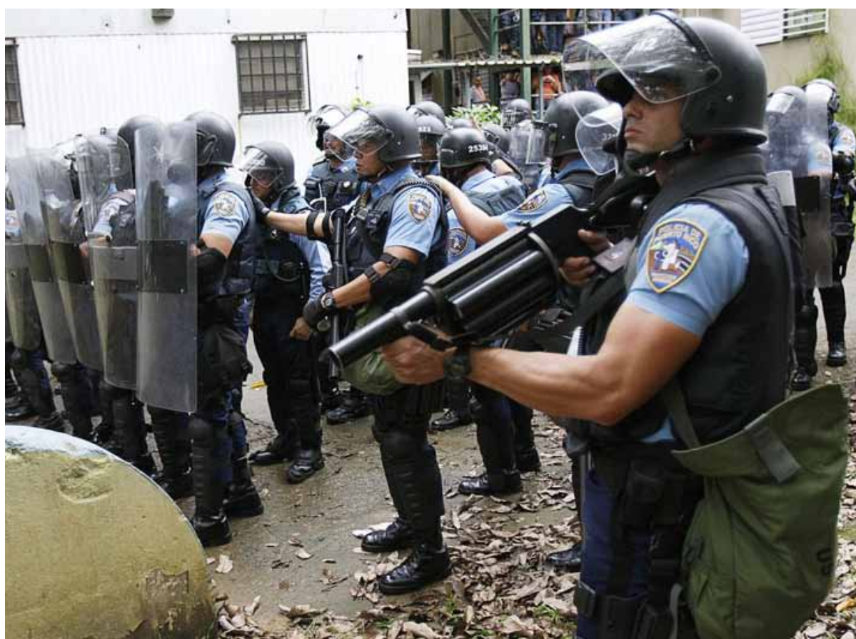
Riot Squad officers in formation on the University of Puerto Rico campus while students march in protest. An officer in the foreground holds a riot gun that fires aluminum canisters of tear gas.

The Puerto Rico Police Department frequently and systematically uses excessive force against protesters. Officers indiscriminately used a toxic form of tear gas, pepper spray, batons, rubber bullets, stinging ball grenades, Tasers, carotid holds, and painful pressure point techniques on protesters.