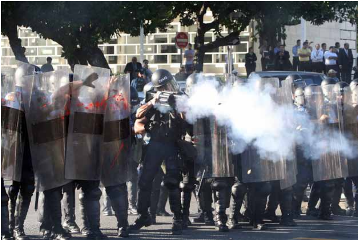
Riot Squad officers indiscriminately fire tear gas and rubber bullets at peacefully protesting students on the University of Puerto Rico campus in February 2011.

The Puerto Rico Police Department fails to provide even basic guidance to its personnel on how to discharge their duties in compliance with the Constitution. The PRPD lacks standard protocols on the use of force and officers receive patently inadequate training, insufficient supervision, and minimal guidance on the legal boundaries of their use of force and other conduct. There is minimal transparency and no effective independent review of the PRPD's policies and practices.