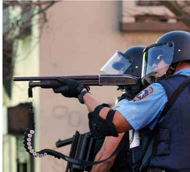
Left, police pepper-spray student protesters on the University of Puerto Rico campus during the April 2010 student strike. Right, a PRPD officer shoots rubber bullets at student protesters.

points. Pressure point tactics not only cause excruciating pain, but they also block normal blood flow to the brain and can be potentially fatal if misapplied. In some cases these pressure point techniques have caused student protesters to lose consciousness.